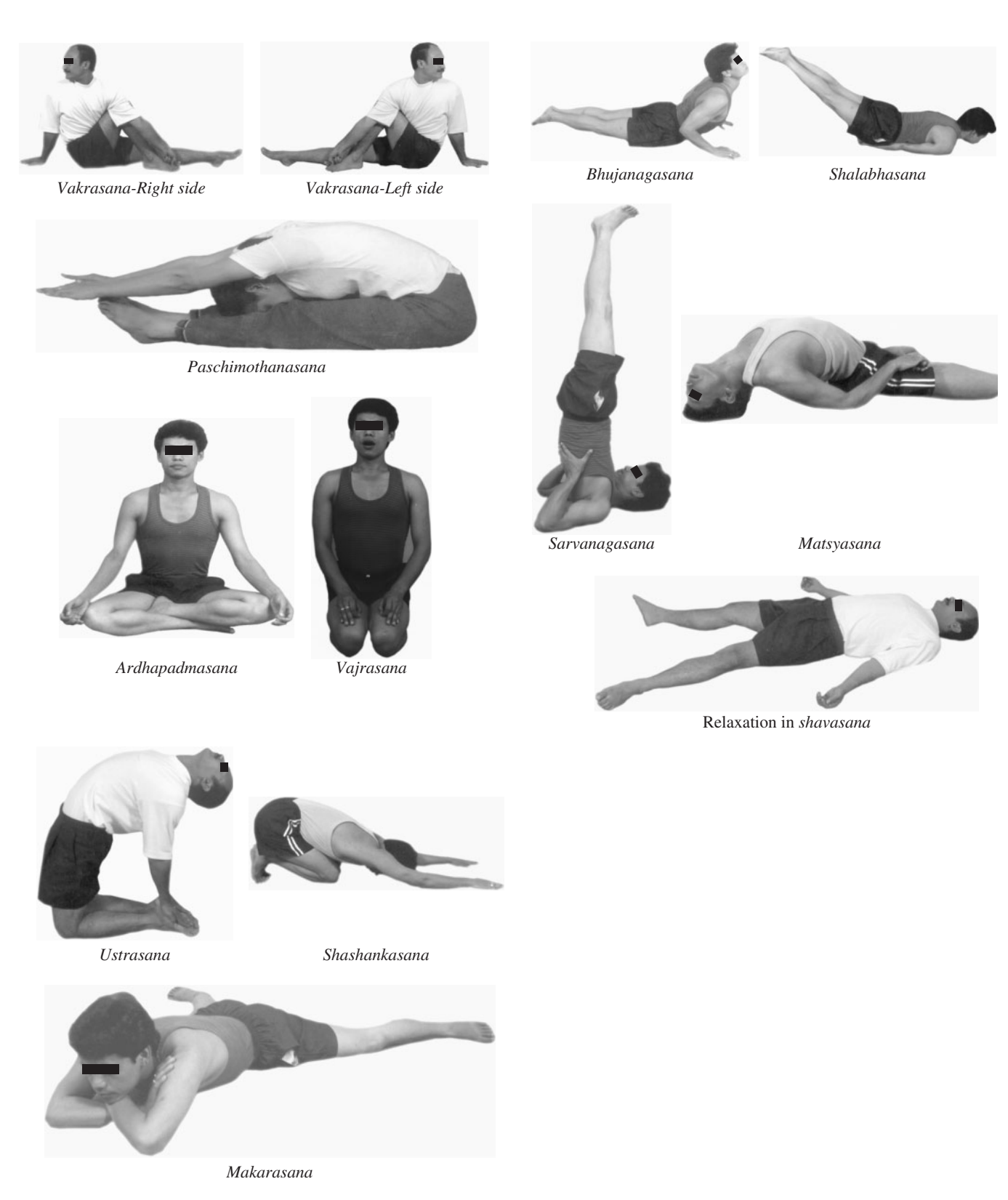
Figure 1. Continued.

inhalation and exhalation were exclusively through the right and the left nostril respectively. These were practiced for nine rounds each. During alternate nostril breathing (nadishudhi) the practice began with exhalation